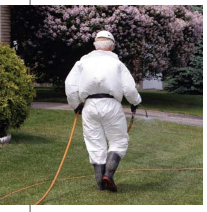
Drift can occur from residential and household pesticide applications, too. It can even happen indoors.

Because some drift can occur with any application (and may be in amounts too small to affect people or property), the laws focus on preventing substantial drift.