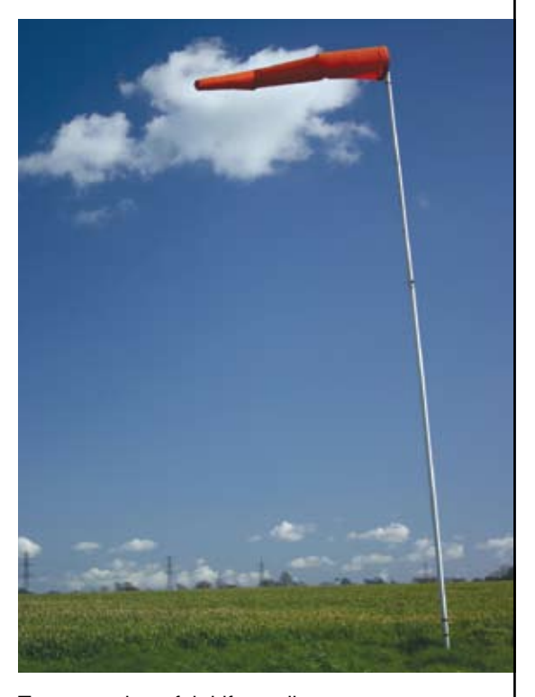
To prevent harmful drift, applicators must evaluate their equipment, the surrounding area, weather conditions, and anything else that may cause problems.

■ Must not make an application likely to result in harmful drift.