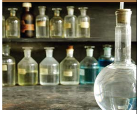
Pesticides typically contain several ingredients, any one of which may produce a sickening odor.

A breakdown product is the result of a chemical breaking apart into other chemicals. Some kinds of pesticides break down when exposed to sun or rain, or to bacteria found in soil. The breakdown is a natural process that may produce a compound that is more or less toxic than the original chemical. Many common pesticide breakdown products contain sulfur, which has a particularly bad smell.