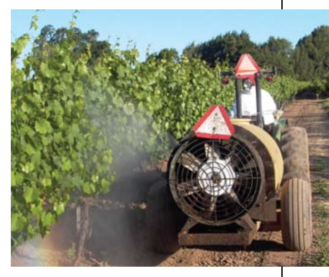
Although some pesticide may move off target in any application, applicators can and must prevent harmful drift.

Because pesticides can drift, applicators are legally required to take all possible measures to make sure that any off-site