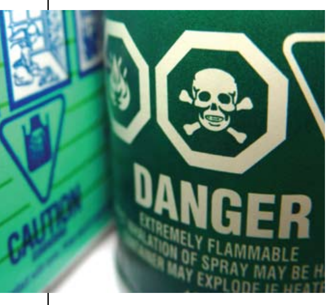
Product labels use three signal words, Danger , Warning or Caution to tell you the potential hazard of a pesticide. Read the label carefully to find out how to use the product safely.