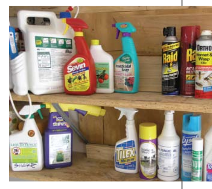
Bring the pesticide container with you when you go to the doctor. The information on the label will help with diagnosis and treatment.

If you are outdoors, move to where you can't smell the pesticide. You may need to move some distance away.