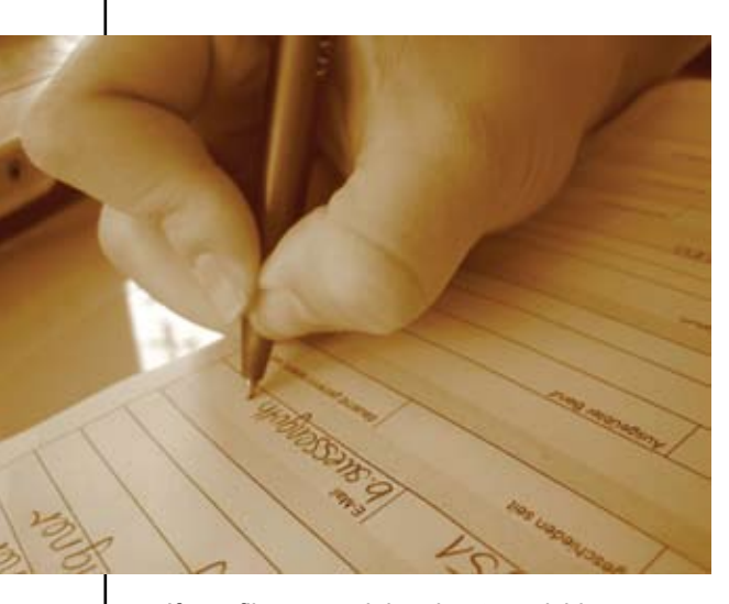
If you file a complaint about pesticide use, you will be asked for certain information. You can use the form beginning on page 30 to make notes before you call.

After you have handled any medical emergency, you may want to write down what happened. The form beginning on page 30 will help you make notes. If you don't have the form handy, here are the general things you should write down: